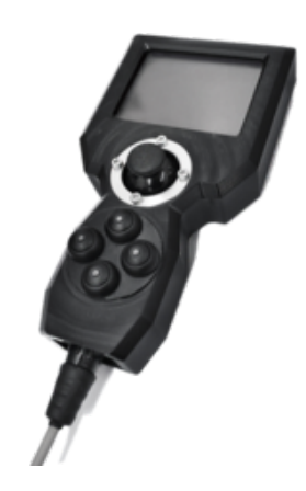
Fig. 2. The Controller of the Robot