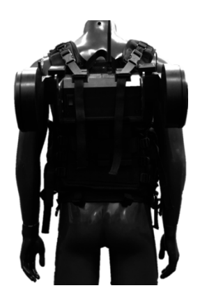
Fig. 3. The Robot inside the Man Packable Vest

In the front of the robot is an interchangeable sensor payload which allows for increased sensor flexibility by accommodating any number of purpose-built sensor payloads. For initial testing, two sensor payloads are being used. The basic sensor payload contains a temperature sensor, optical camera, LED, microphone and IMU. If further sensor capability is desired, the advanced payload includes the abovementioned sensors and adds a thermal camera, gyroscope and magnetometer. In order to keep both size, cost and complexity to a minimum, small internal embedded controllers have been used. Although this eliminates the possibility of complex on-board functionality such as mapping and image