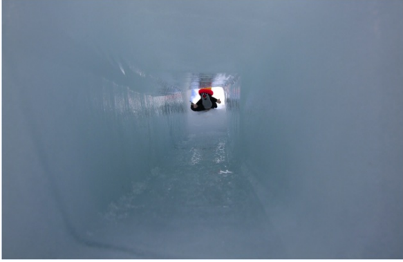
Figure 3: Channel 1, 45° upwards, \approx 1.5 m.