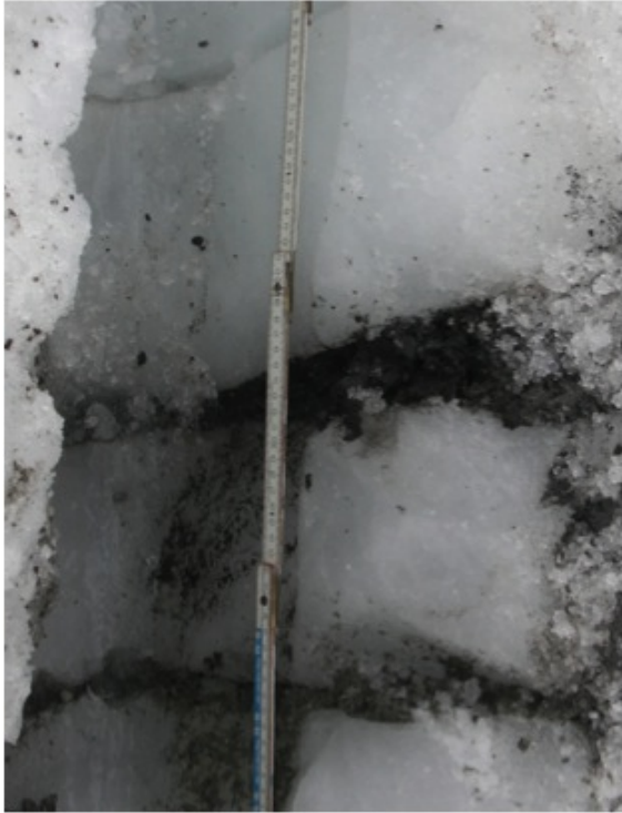
Figure 5: Channel 3, 45° downwards, \approx 3 m, penetration of \approx 4 cm of "dirt" (found on the glacier).