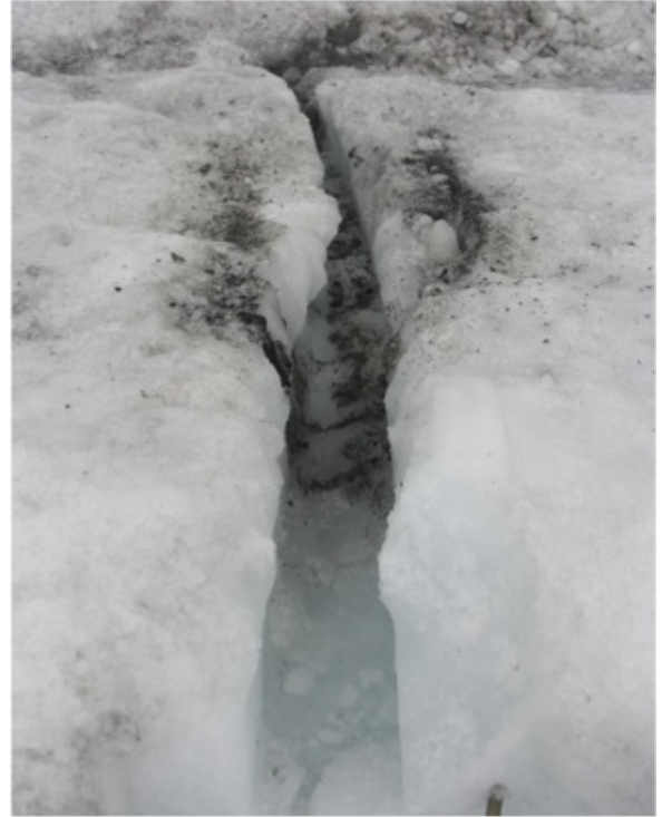
Figure 6: Channel 3, 45° downwards, \approx 3 m, curve with a radius of \approx 10 m (channel was opened afterwards).