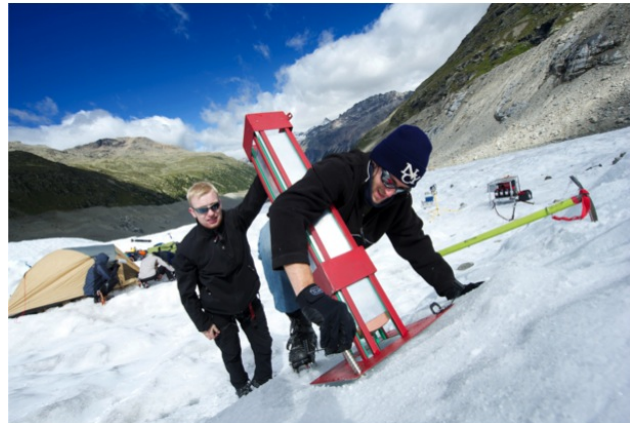
Figure 2: Deployment of the IceMole on the Morteratsch glacier.