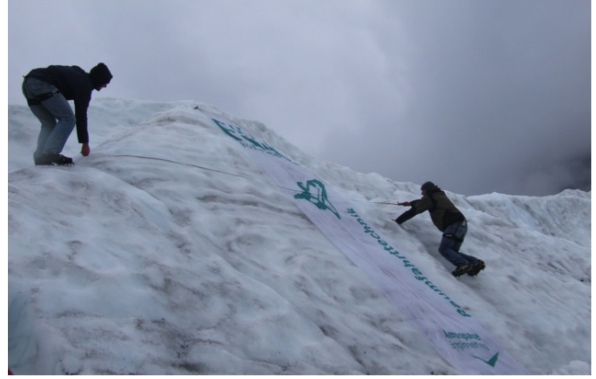
Figure 4: Channel 2, horizontal, \approx 5 m.